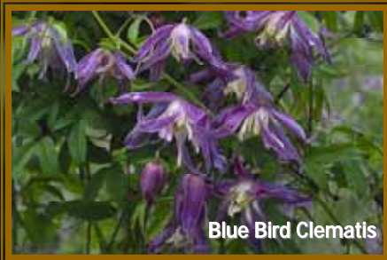
Blue Bird Clematis