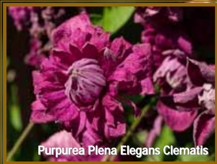
Purpurea Plena Elegans Clematis