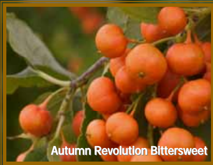
Autumn Revolution Bittersweet