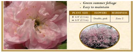
Sample P-O-P sign (11" x 7")