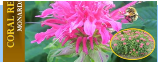
Sample P-O-P poster (11" x 17")