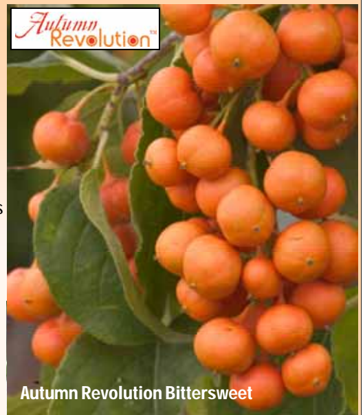
Autumn Revolution Bittersweet

We look forward to meeting many of our customers at the coming fall tradeshow in Edmonton and Saskatoon. Until then, enjoy autumn!