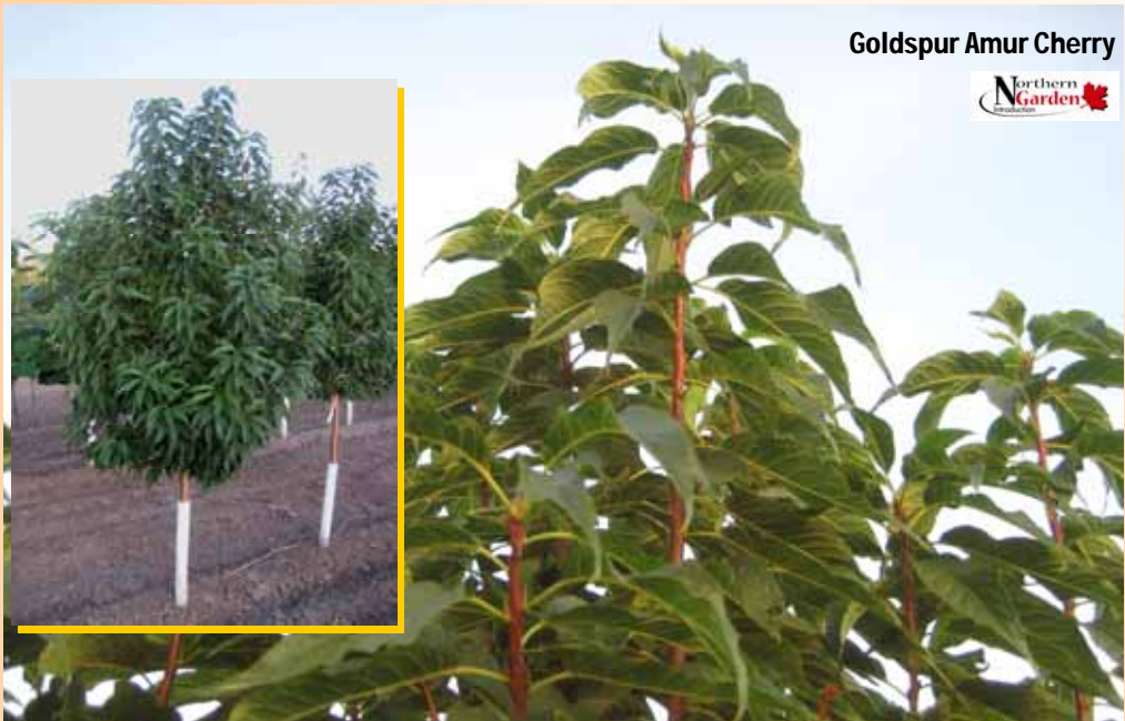
Goldspur Amur Cherry