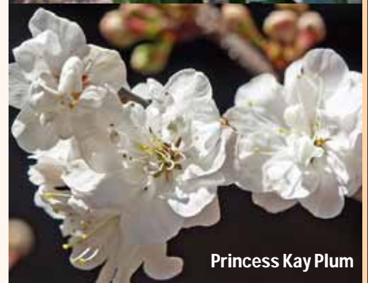
Princess Kay Plum