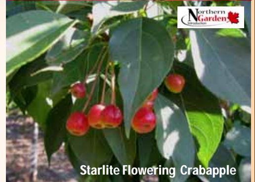
Starlite Flowering Crabapple