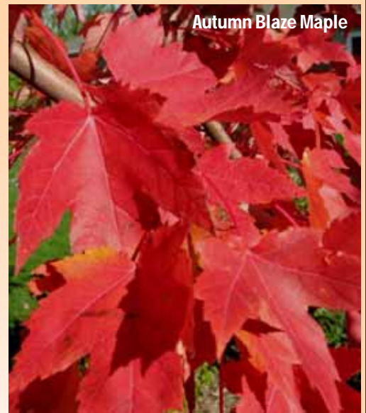
Autumn Blaze Maple

In the Linden genus, we continue to produce reliable cultivars such as Glenleven and Harvest Gold . Glenleven is a hybrid between our native basswood ( Tilia americana ) and it's European cousin ( Tilia cordata ). Introduced by Sheridan Nursery, Glenleven has a moderate growth rate and an attractive upright form. For those in zone 2, consider setting aside cultivars and working with American Linden (Basswood) . Our field and container production of Basswood is derived from local seedlings known to offer excellent cold hardiness.