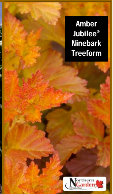
Amber Jubilee® Ninebark Treeform