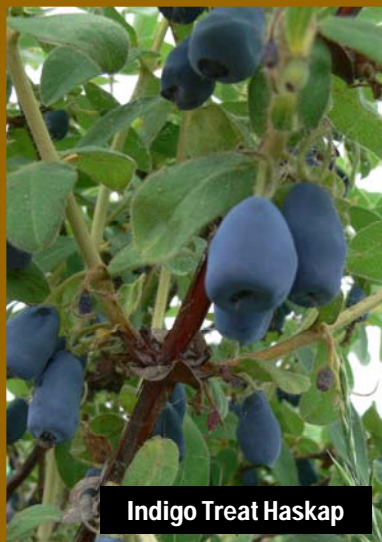
Indigo Treat Haskap