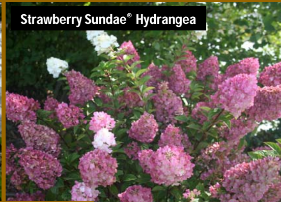
Strawberry Sundae® Hydrangea