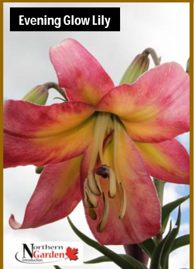
Evening Glow Lily