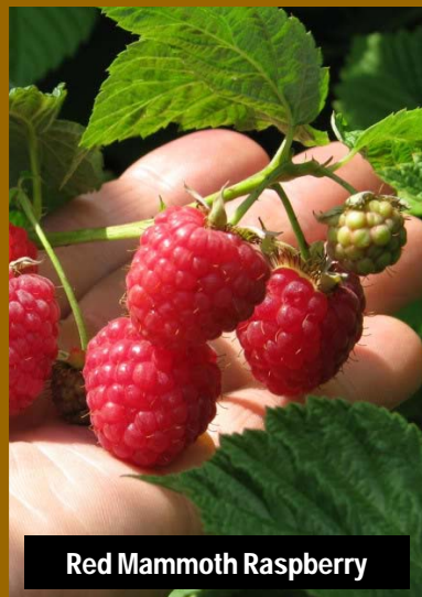
Red Mammoth Raspberry