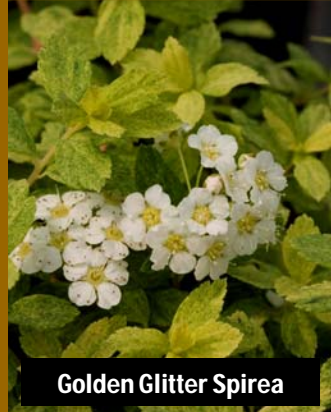
Golden Glitter Spirea