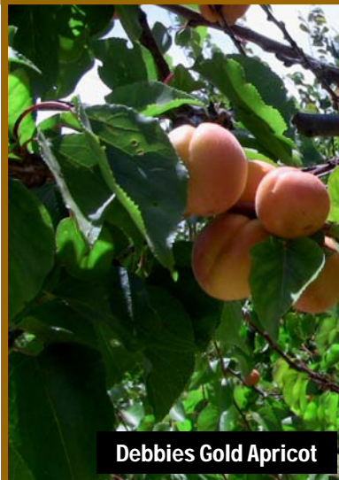
Debbies Gold Apricot