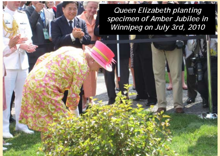
Queen Elizabeth planting specimen of Amber Jubilee in Winnipeg on July 3rd, 2010