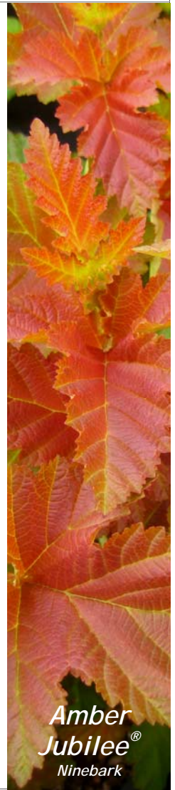
Amber Jubilee® Ninebark