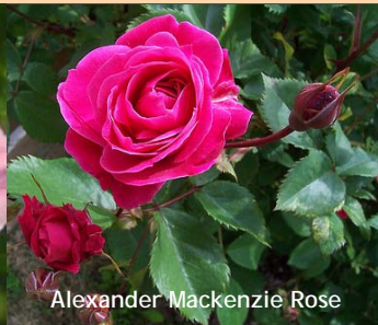
Alexander Mackenzie Rose