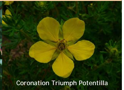
Coronation Triumph Potentilla