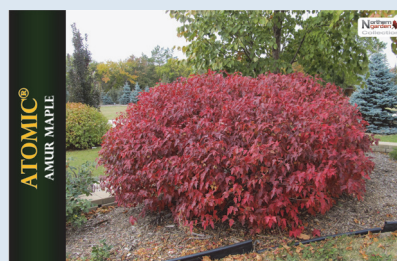
Sample P-O-P poster (11" x 17")